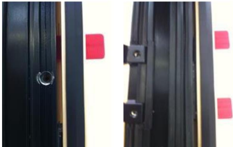
Photo 5 Pre-drilled fixing location

The recommended fixing point is in the channels behind the gasket seals so that the fixings are disguised, the gasket seals can be easily removed and reinserted to facilitate this. (See photos 5 & 6)