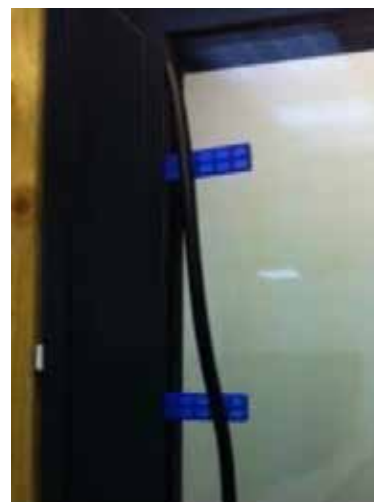
Photo 17 Insert packers to secure bead and facilitate gasket insertion.

Continue to glaze all panels in this manner, observing notes below.