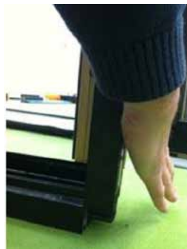
Photo 7 Use the palm of your hand to slide the jambs into the tracks

Offer the frame into the opening and locate down onto previously fitted sill or levelled base and using a suitably long level plumb and mark frame position onto sidewalls. Proceed to drill and fix side jambs through the earlier pre drilled holes in the jambs into the sidewalls of the structure. Use suitable PVC glazing packers to space out tolerance gap between jamb and wall. It is good practice to pack both above and below each individual fixing to prevent flexing the frame.