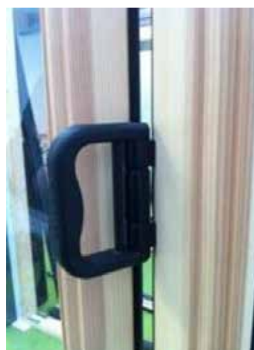
Photo 9 Fitted pull handle to outward opening systems

Using a 3mm Allen key release the locking grub screw and then with a 6mm Allen key adjust the height of the panel to achieve the same tolerance gap between underside of panel 2 and the bottom track at this point as that on panel one between panel and track where it is attaches to the hinge jamb