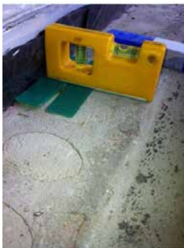
Photo 1 Levelling & packing front to back