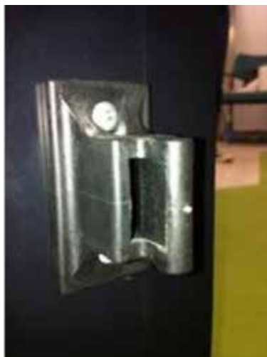
Photo 13 Male panel catch section with cut-out which should face the opposite way of the projecting arm of the female section