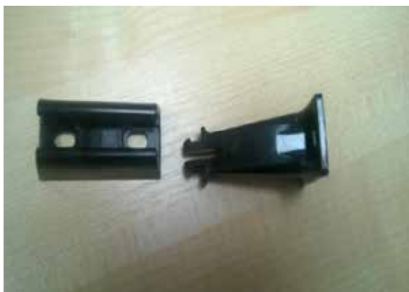
Photo 15 Sliding panel catch male and female parts