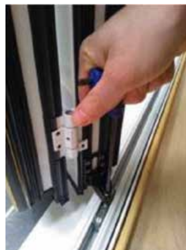
Photo 10 Adjusting the setup height

Close panels one and two before attaching panel three again with hinge pins provided, continue then to connect any remaining panels in the same manner and adjust heights to the "set up height"