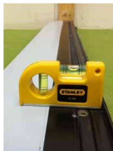
Photo 4 Checking sill is level

The remaining outer frame sections are flat packed in bubble wrap; take care if using a knife when unpacking these, as they are finished painted surfaces.