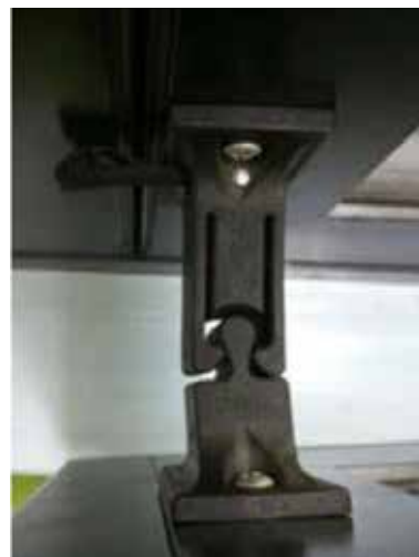
Photo 14 Two sections combined