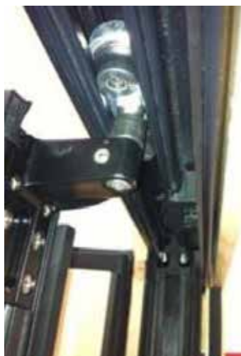
Photo 19 Adjustment bolt with collar