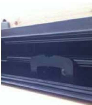
Photo 18 Larger section of catch fitted to head