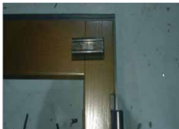
Photo 16 Panel catch fitted horizontally on panel