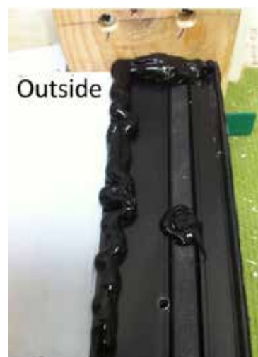
Photo 8 Silicone bead between sill and track