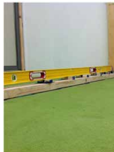
Photo 3 Levelling left to right