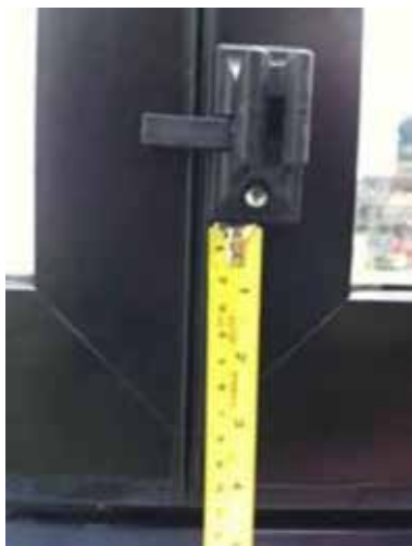
Photo 12 Female panel catch section with arm projecting across adjacent panel

If the single leaf panel releases from the stack of doors when the system is fully open then the male part of the panel catch has been fitted the wrong way round, remove this part rotate 180° and reattach to rectify. The cut-out should always face the opposite way the arm of the catch projects.