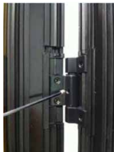
Photo 11 Securing hinge pins

Now proceed to follow relevant points below for your system in relation to fitting handles, panel catch, glazing of panels, fitting of closing rebate, stacking clip and making final adjustments and checks.